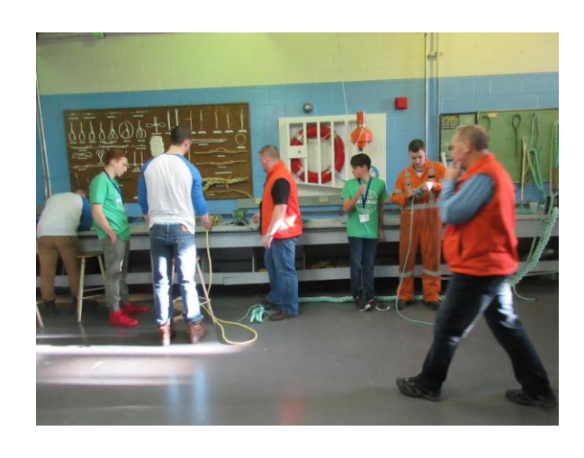
Cargo Work / Ballast Work: