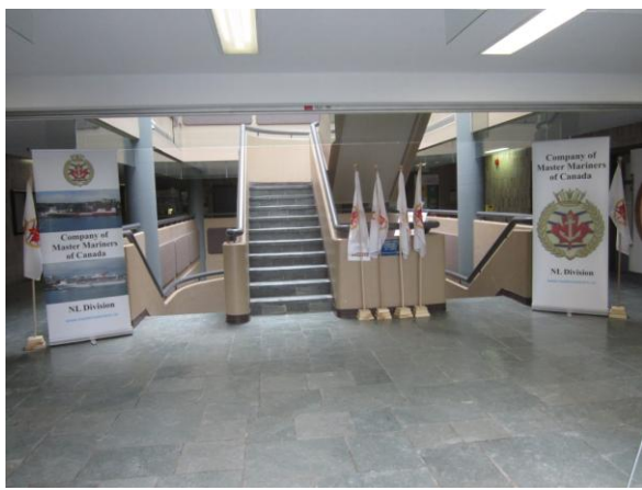
Main Foyer at the Marine Institute