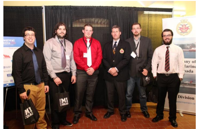
Team 1, Achievement (Canadian Coast Guard Sponsor)