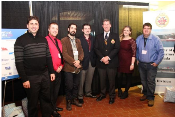
Team 5, Communication and Leadership