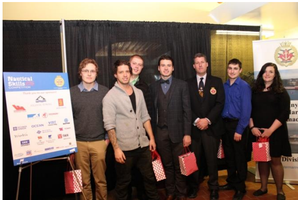
Team 2, Professionalism (Marine Atlantic Sponsor)