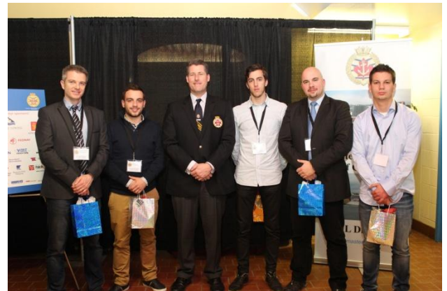
Team from Croatia